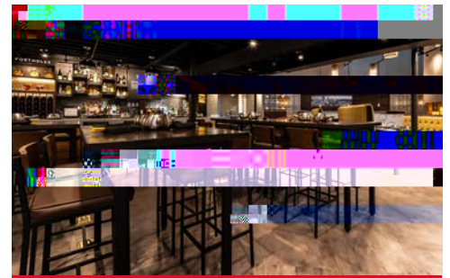
Melting Pot Restaurant in Pittsburgh

This journey and the learnings along the way have helped us weave a strong cultural fabric that, while far from perfect, provides a foundation from which to recruit, coach and develop our