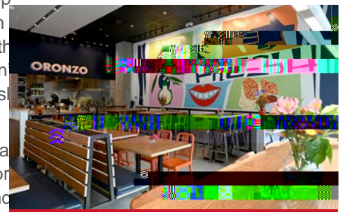
ORONZO Restaurant in Midtown Tampa